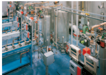
Hydro Lab in Badger Meter's James O. Wright Innovation Center

State-of-the-art manufacturing and inspection processes ensure product quality and long lasting measuring accuracy. Every meter is subjected to rigorous testing according to ISO 9000 quality directives and EMC rules.